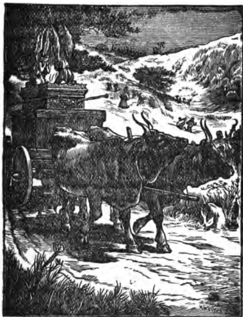
COWS DRAWING THE ARK OF THE COVENANT.

cows to the wagon and turn them loose and let them take it as they pleased. The idea was, that if the Lord wanted the Israelites to have possession of the Ark He would direct the cows toward the land of Israel. The cows had young calves; and to make