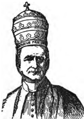
A ROMAN CATHOLIC POPE.

Now let us refer to Rev. 13:18 and see what it means. The words are: "Here is wisdom. Let him that hath understanding count the number of the beast; for it is the number of a man, and his number is 666." This appears as