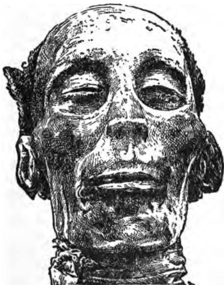
SETI I. (THE OLDER PHARAOH).

The other mummy, that of Seti I, the father of Rameses, shows, if anything, a more kindly type of organization, the forehead being higher, broader, and the features softer in outline. He was "the new king