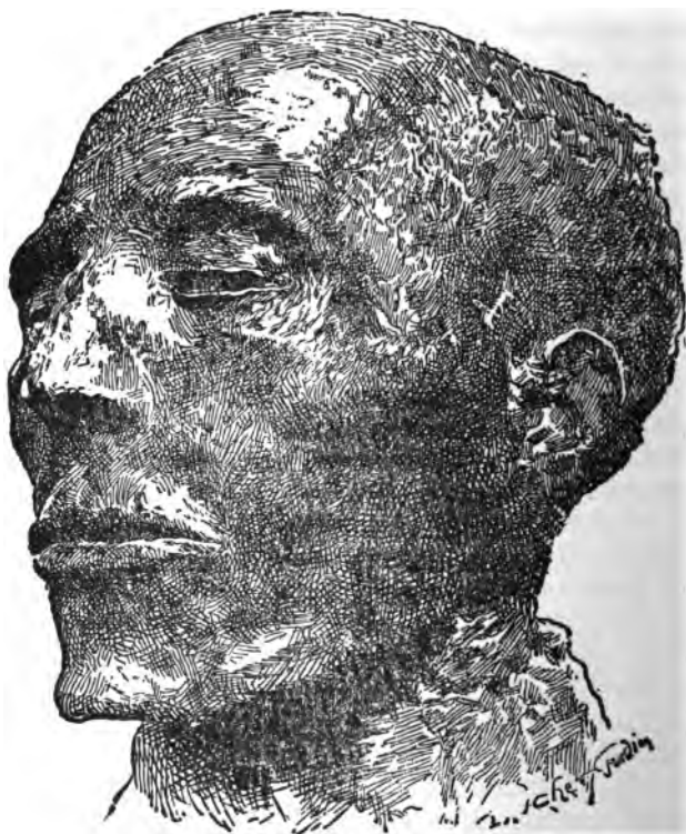
RAMESSES II. (PHARAOH).

Not many people know that the embalmed body of Pharaoh has been found, as the newspapers are so busily engaged in reporting murders and arguing politics that scarcely any of them even noticed this great "find."